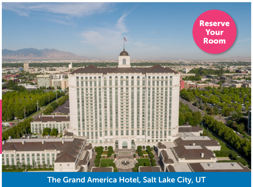
The Grand America Hotel, Salt Lake City, UT

Be sure to make your reservations early! The room block will be released on April 7th but is likely to sell out before that date.