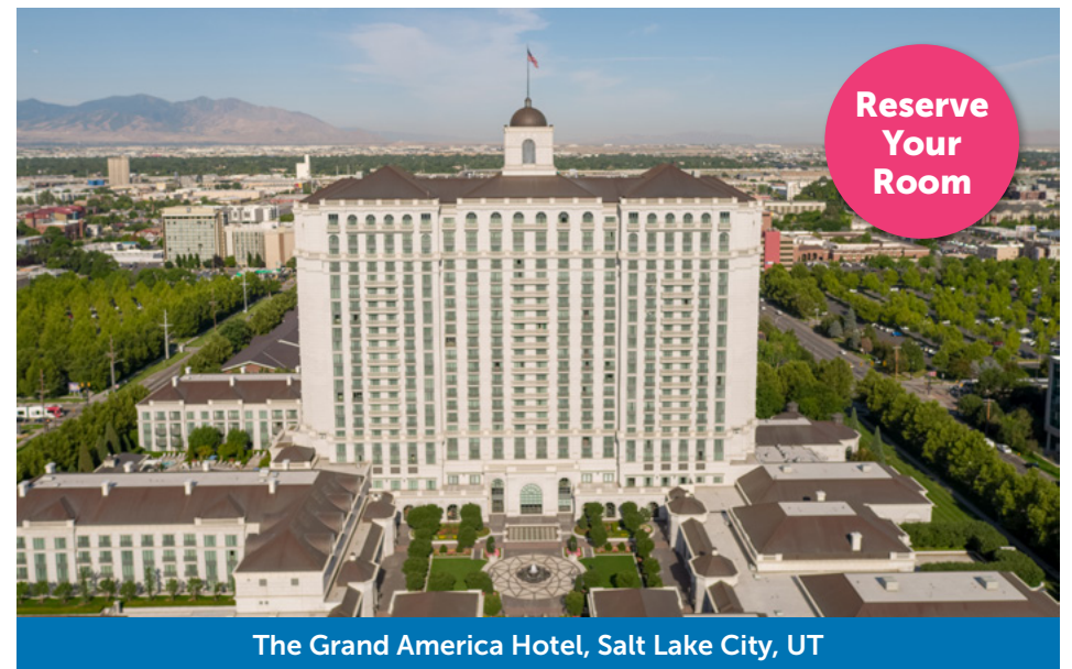
The Grand America Hotel, Salt Lake City, UT

Be sure to make your reservations early! The room block will be released on April 7th but is likely to sell out before that date.